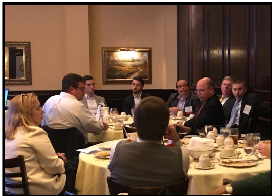
Networking and discussion over dinner at the November 15, 2018 Dinner Meeting