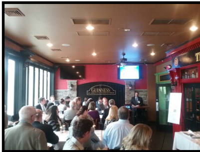
A great night of networking and celebrating with EFPC of SNJ at Tir Na Nog in Cherry Hill